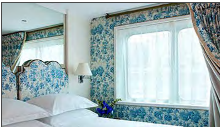
RIVER BARONESS – CATEGORY 2 & 3 STATEROOM