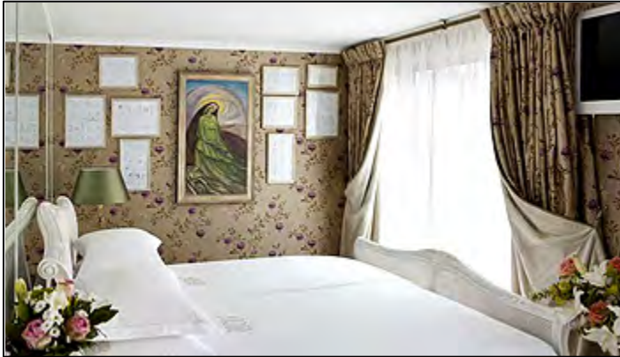
RIVER BARONESS SUITE

Marble bathrooms feature L'Occitane en Provence bath and body products, plush towels, waffle bathrobes, and slippers. All suites have many additional special amenities and services.